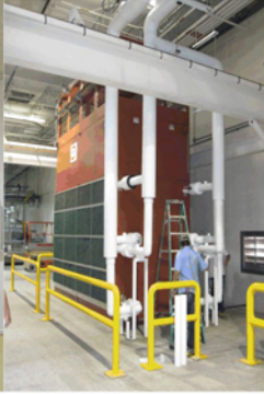
220 TONS CHILLED WATER