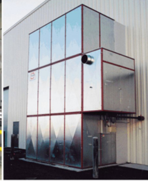
4125 MBH WEATHERPROOF HEATING UNIT