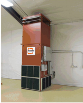
20 TONS DX WITH ELECTRIC HEAT

THE STANDARD OF EXCELLENCE IN HEATING, COOLING & AIR CLEANING EQUIPMENT FOR THE COMMERCIAL AND INDUSTRIAL MARKET